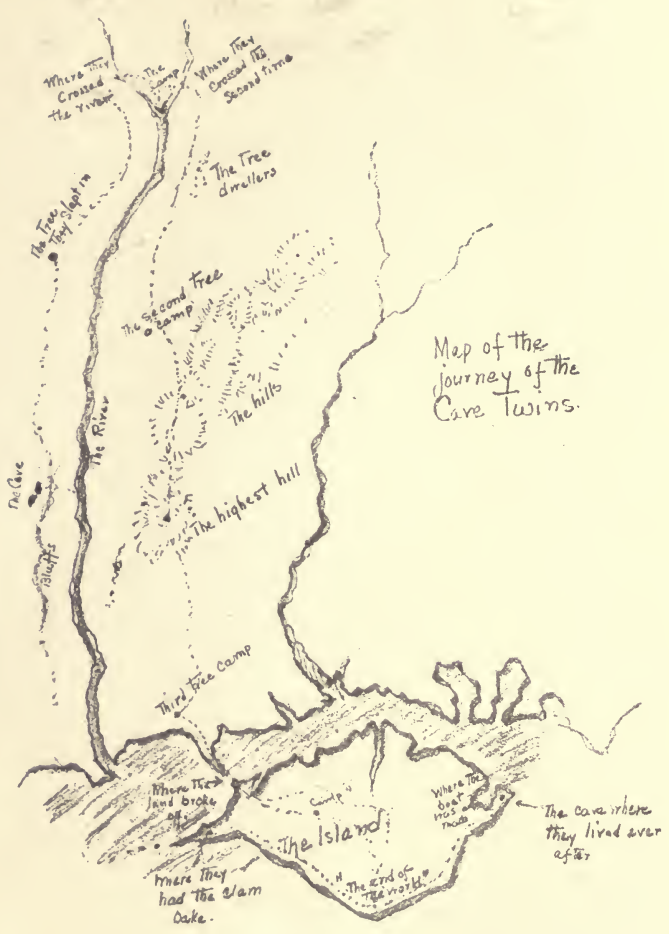
Map of the journey of the Cave Twins.